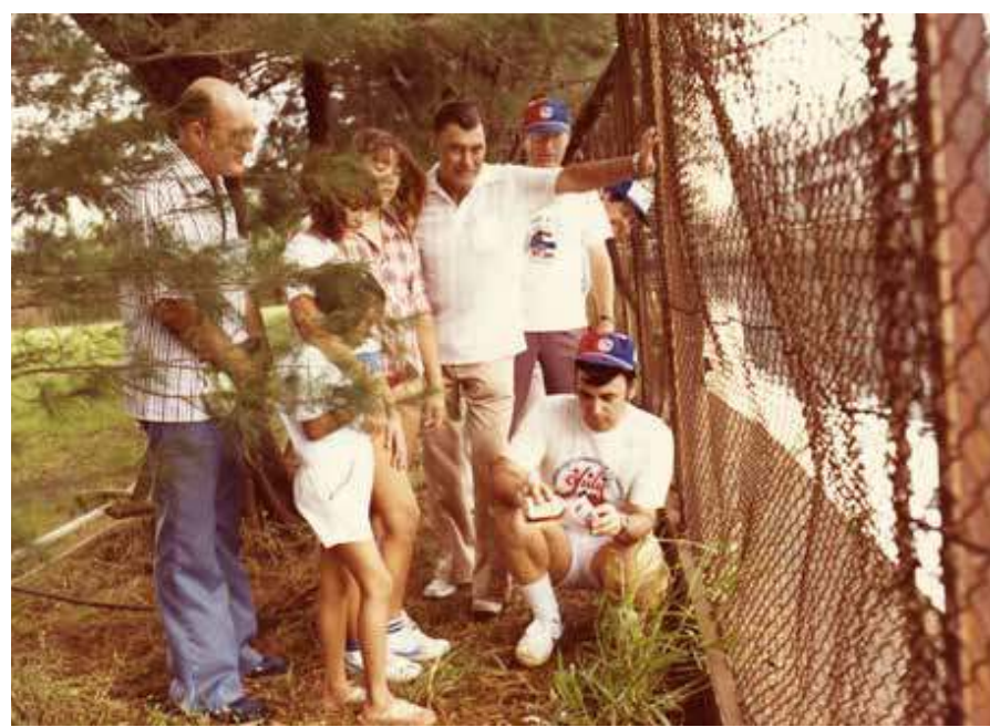
Pouring Mekhong whiskey into the khlong to invite the water spirits

another looming disaster got headed off at the pass.